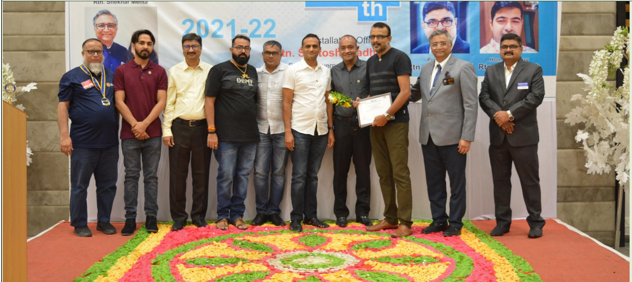
AT ROTARY CLUB OF CHIKHLI RIVER FRONT, WE HAVE AN OUTSTANDING TEAM MEMBERS WHO ARE READY TO WORK FOR A CAUSE AND HAVE WORKED WITH DEDICATION.