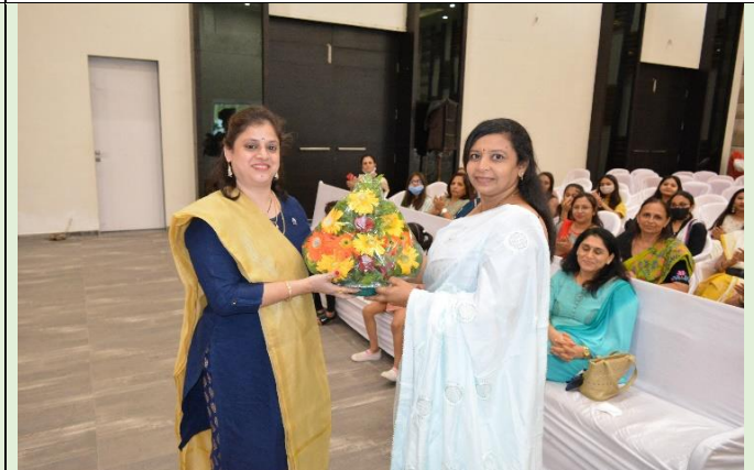
WELCOMING OF FIRST LADY RTN SUNETRA PRADHAN