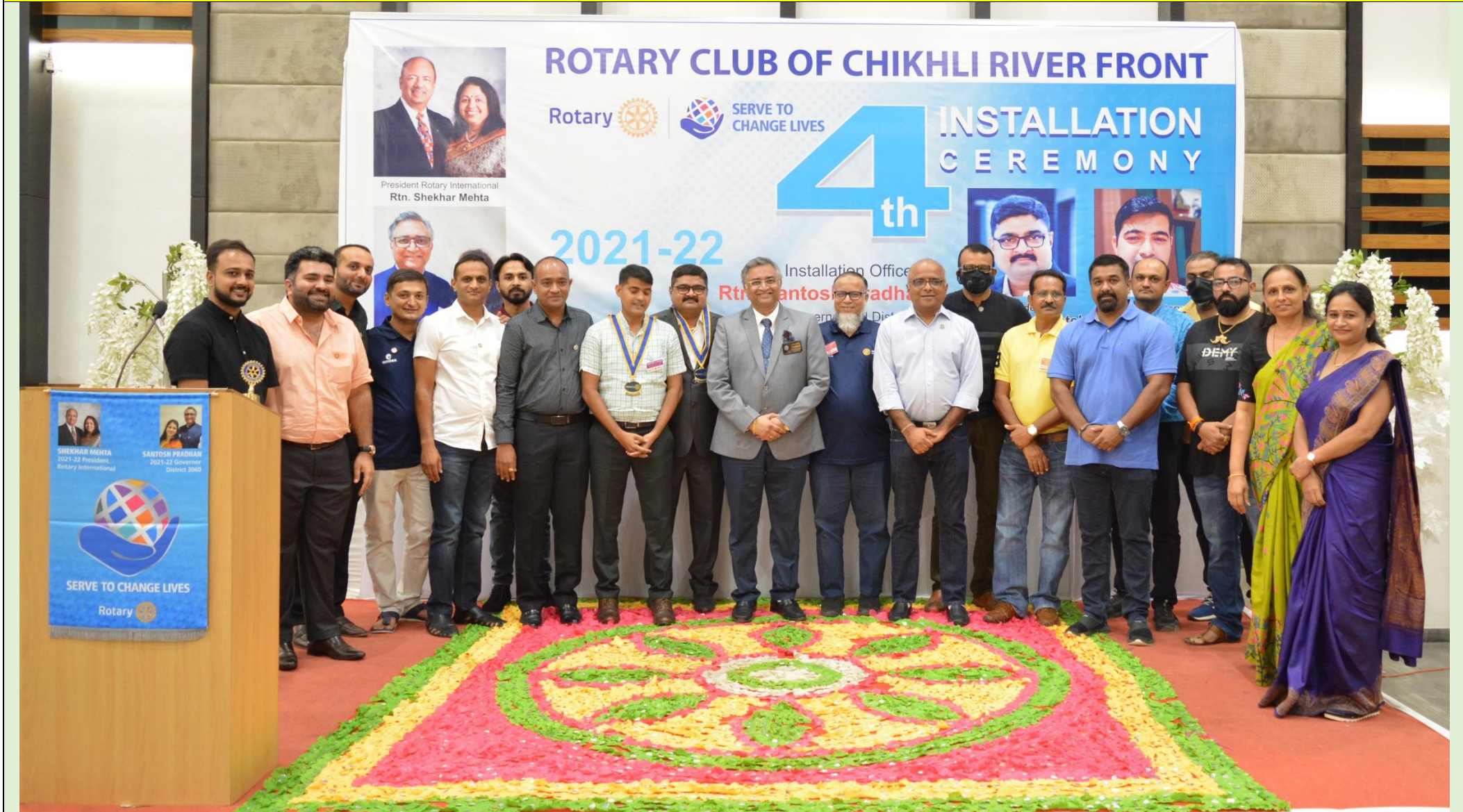
BEST OF LUCK TEAM CHANGEMAKERS