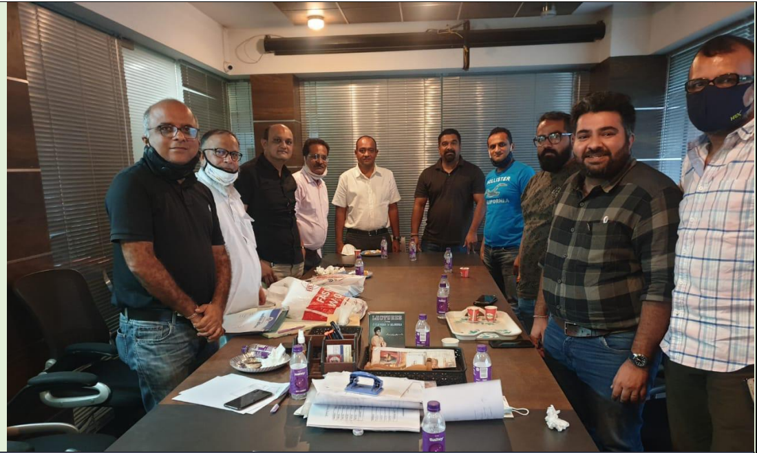
SOME OF OUR TEAM MEMBERS IN A MEETING