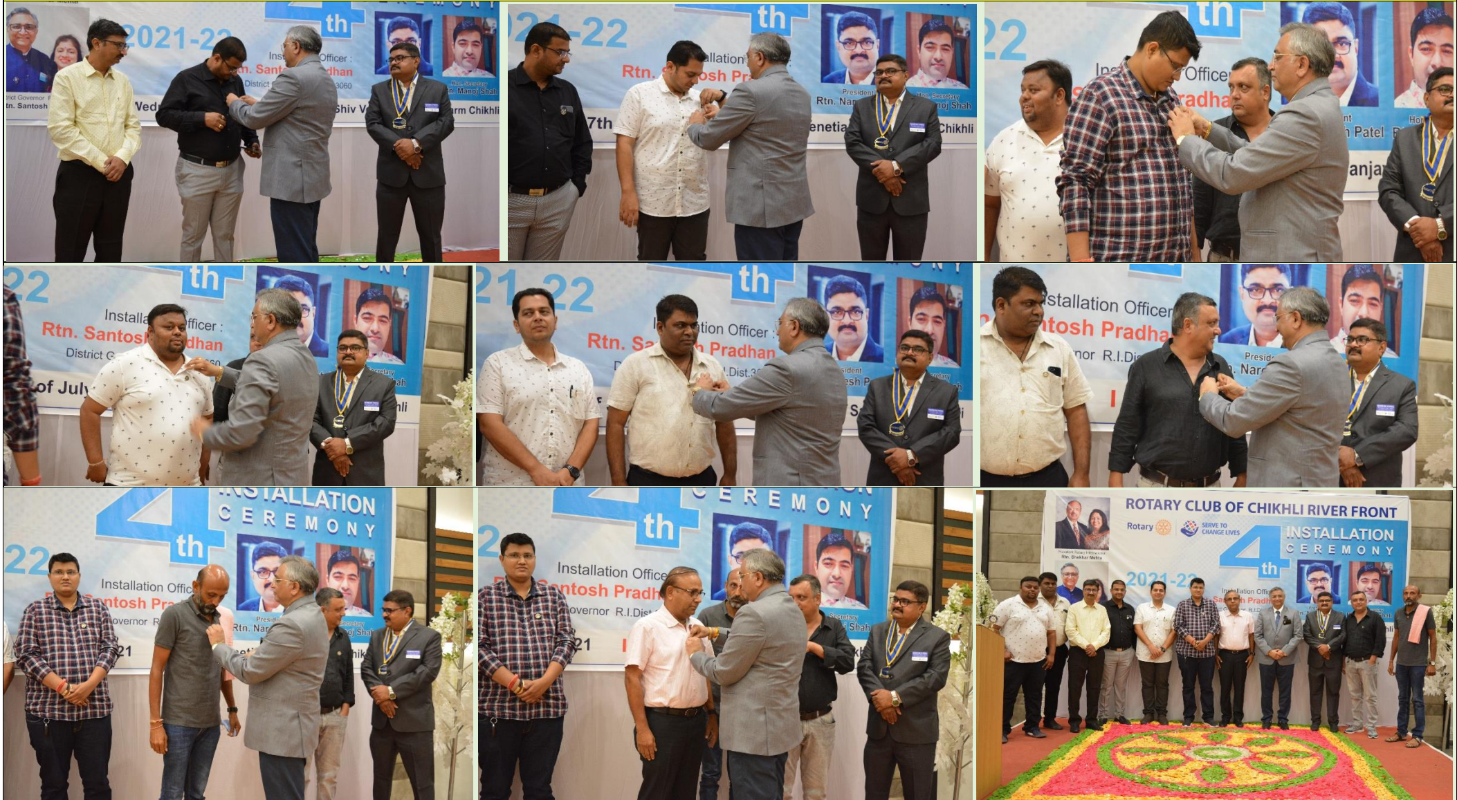
WELCOME TO ROTARY FAMILY - BEST OF LUCK TEAM CHANGEMAKERS